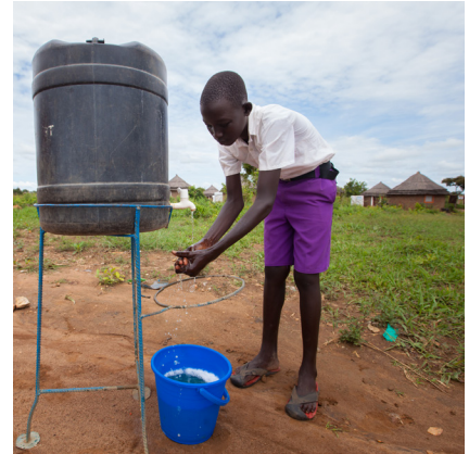
A boy practices what he learned about handwashing from his WASH club.

In Kamwokya, a neighbourhood of Kampala, inadequate sanitation facilities and a lack of hygiene knowledge leave many community members vulnerable to infectious diseases. WASH clubs use games to teach children about good hygiene practices and disease prevention. When COVID-19 hit, youth leaders from WASH clubs sprang into action, using radio and community awareness campaigns to empower more than a thousand children and adults with information about proper handwashing technique and how to protect themselves from COVID-19 and other diseases.