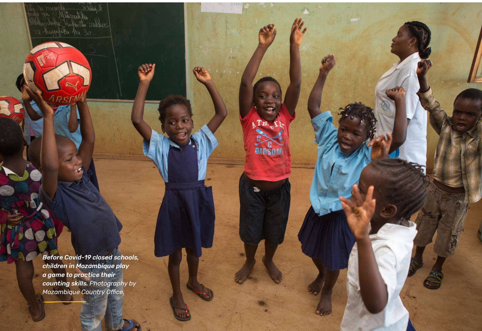
Before Covid-19 closed schools, children in Mozambique play a game to practice their counting skills.